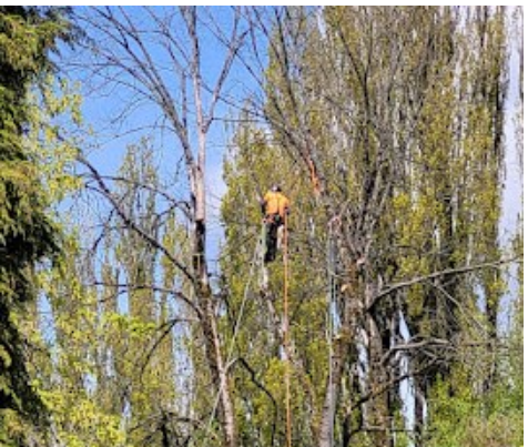
Arborists in trees removing Dutch Elm Disease ridden trees.